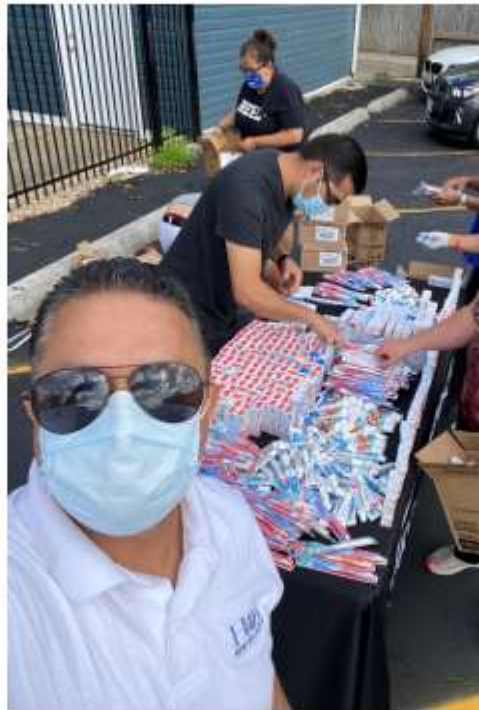
The Greater Chicago HDA Outreach event Back to School giveaway Aug 30