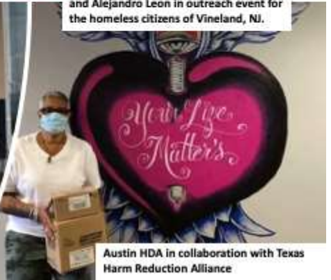
Austin HDA in collaboration with Texas Harm Reduction Alliance