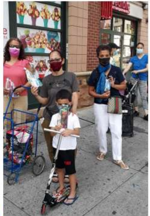
The New York HDA and The Hopeline Organization outreach event Aug 11