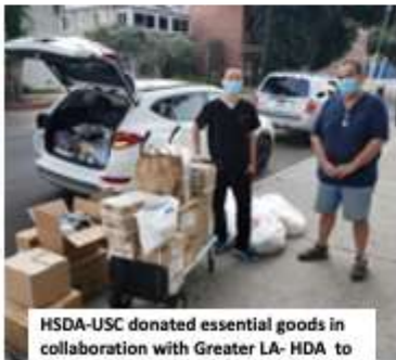
HSDA-USC donated essential goods in collaboration with Greater LA- HDA to the Latino Resource Organization for distribution to those most in need.